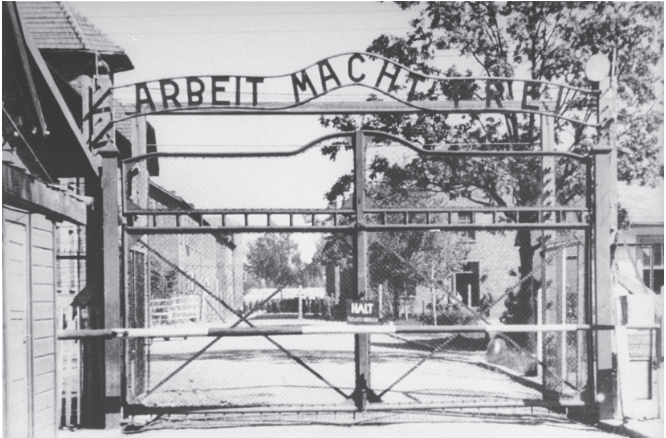
Entrance to Auschwitz. The sign is in German and translates to: "Work makes you free."