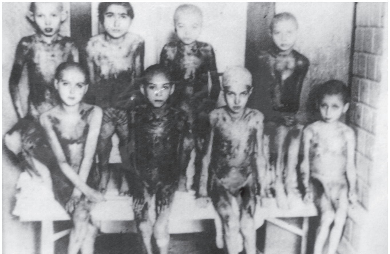
Picture of twins in lab.